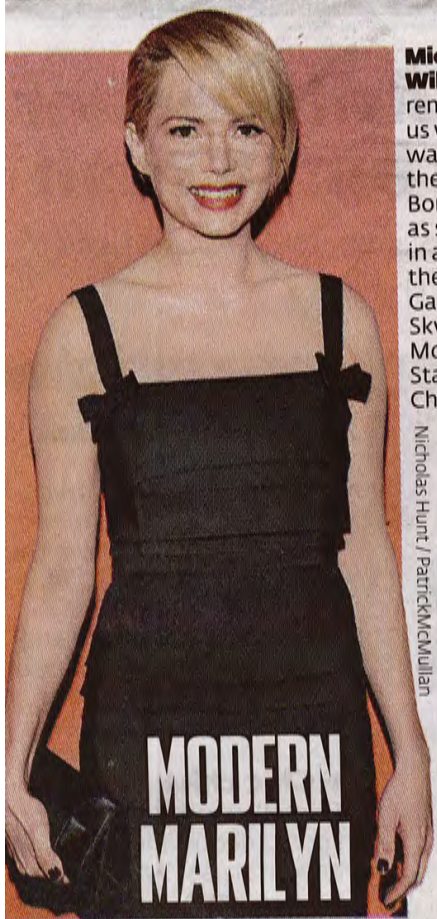
Michelle Williams reminds us why she was cast as the Blonde Bombshell, as she arrives in a LBD to the Whitney Gala at the Skylight at Moynihan Station in Chelsea.