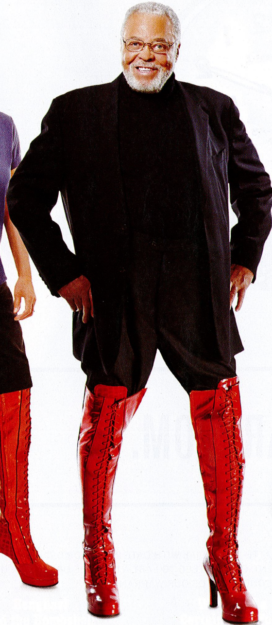
James Earl Jones for The Stuttering Association for the Young