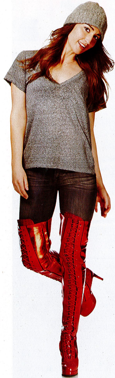
Sara Bareilles for Rock n' Roll Camp for Girls Los Angeles