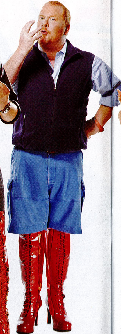
Mario Batali for Cookies for Kids' Cancer