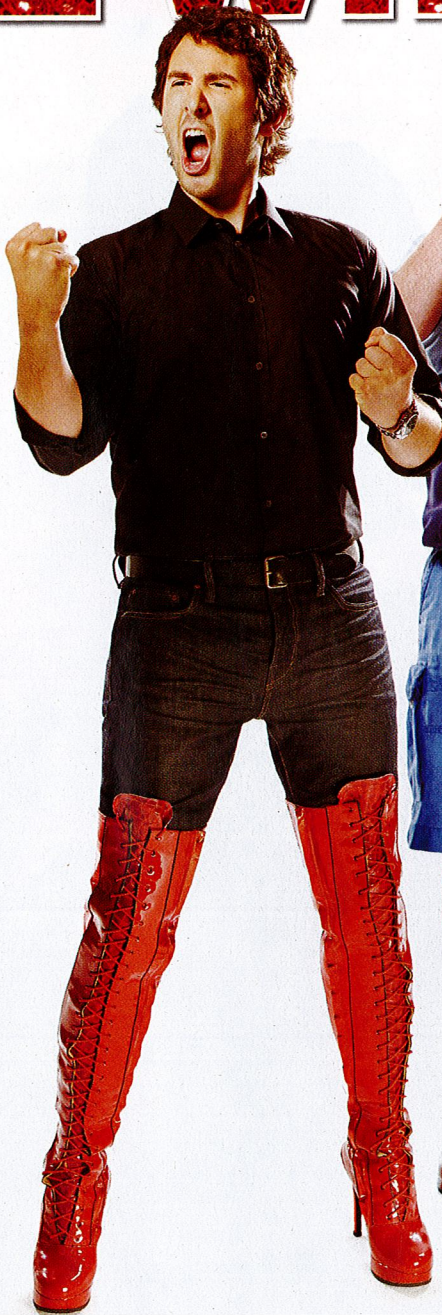
Josh Groban for Find Your Light Foundation