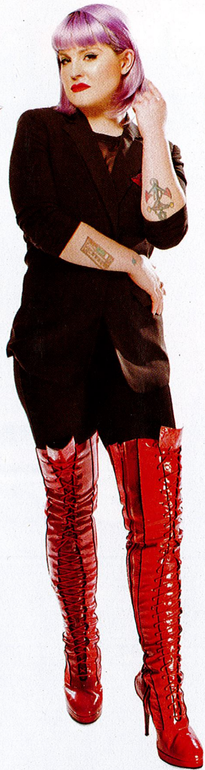
Kelly Osbourne for Prince's Trust