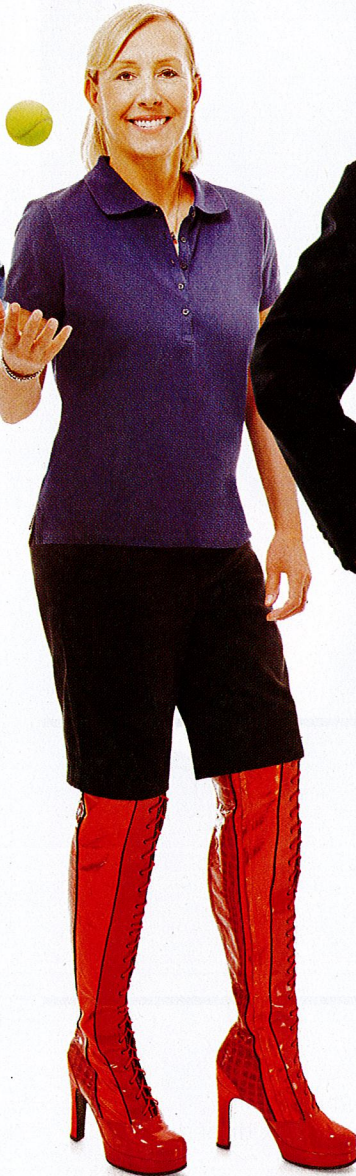
Martina Navratilova for Humane Society of Greater Miami