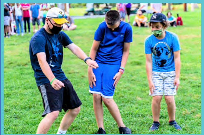
This is How We Move!