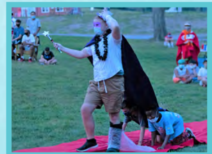
Everyone was IN!

Camp SAY 2021 was so fortunate to be sponsored in part by the incredibly generous JOANN Fabric & Craft Stores! JOANN provided our campers with everything a kid could dream about for crafts, costumes, games, decorations and more!