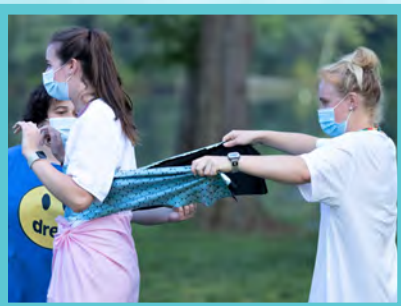
Camp SAY Project Runway